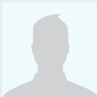
Chief Technology Officer