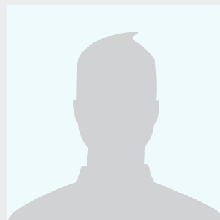
Head Retail Banking