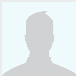
Deputy Chief Executive Officer & Chief Financial Officer

Chief Executive Officer & Managing Director