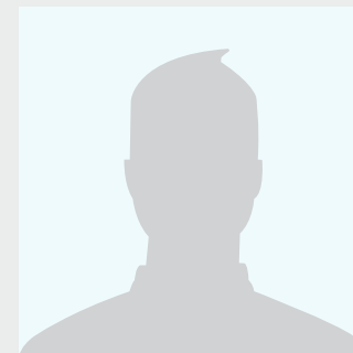
Head Retail Banking