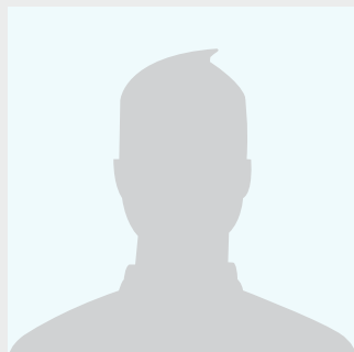
Deputy Chief Executive Officer & Chief Financial Officer