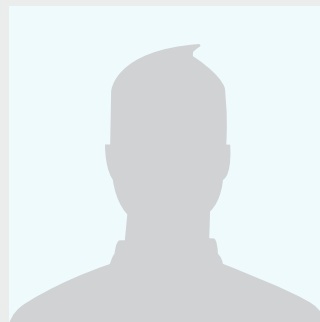
Chief Technology Officer